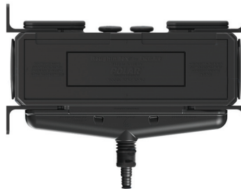
(Figure 1) RBX-1 Product Image