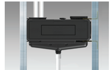
(Figure 2) Typical RBX-1 Center Drain RoughinBox location