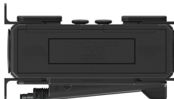
(Figure 3) RBX-2 Product Image